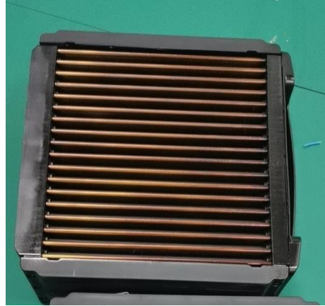
Figure 2: Ionization module photos